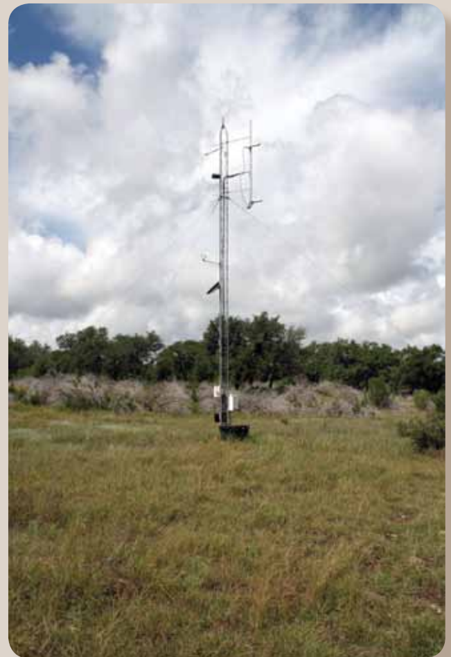
Figure 1. Evapotranspiration station in the treatment watershed at site TWS ET (U.S. Geological Survey station 295102098283200 Honey Creek treatment evapotranspiration near Spring Branch, Texas), Honey Creek State Natural Area, Comal County, Tex., July 23, 2010.

The U.S. Geological Survey (USGS), in cooperation with Federal, State, and local partners, examined the hydrologic effects of brush management in two adjacent watersheds (figs. 1 and 2). Hydrologic data were collected in the watersheds for 3–4 years (pre-treatment) depending on the type of data, after which brush management occurred on one watershed (treatment watershed) and the other was left in its original condition (reference watershed). Hydrologic data were collected in the study area for another 6 years (post-treatment). These hydrologic data included rainfall, streamflow (fig. 3), evapotranspiration (fig. 1), and water quality. Groundwater recharge was not directly measured, but potential groundwater recharge was calculated by using a simplified mass balance approach.