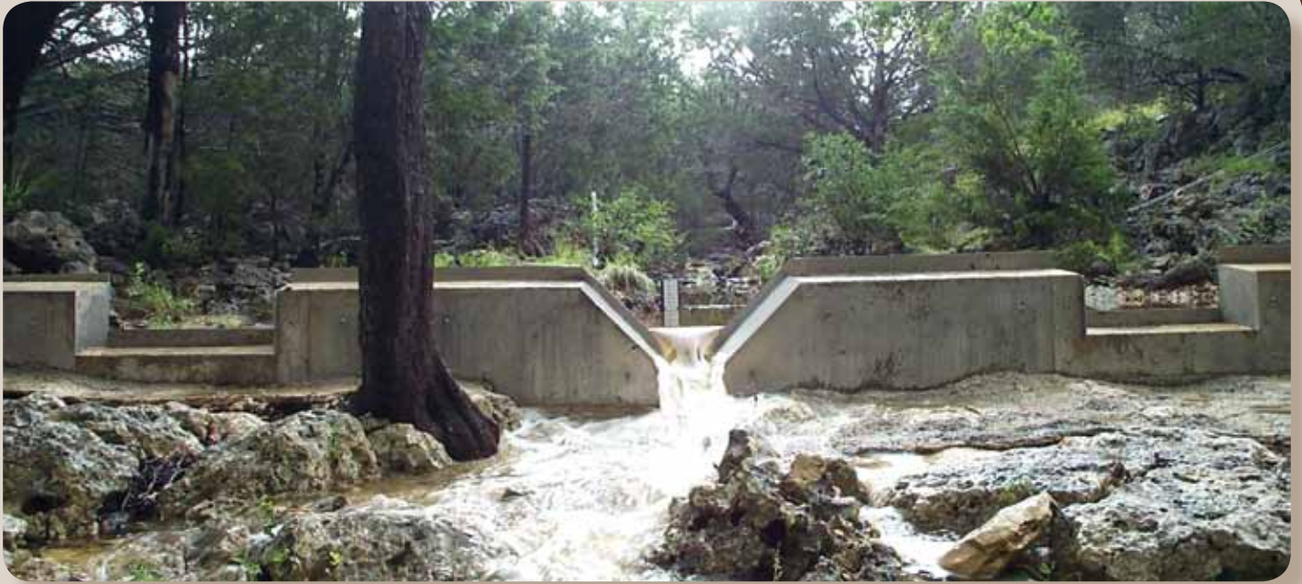
Figure 3. Streamflow-gaging stations were installed in the study area, such as this weir in the treatment watershed at site 2T (U.S. Geological Survey station 08167353 Unnamed tributary of Honey Creek site 2T near Spring Branch, Texas), Honey Creek State Natural Area, Comal County, Tex.

The following highlights of the study are summarized from the USGS Scientific Investigations Report (Banta and Slattery, 2011) on which this fact sheet is based: